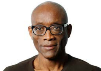
BILL T. JONES